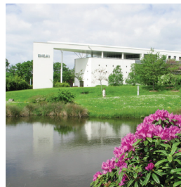
On Rennes Atalante Ker Lann, the companies are located in an exceptional working environment.