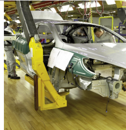
10,000 people work for the production site of top of the range cars of PSA Peugeot Citroën in Rennes.