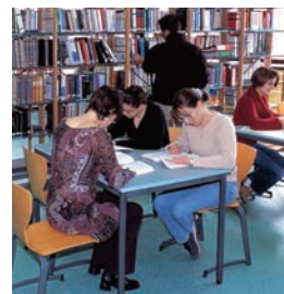
6,500 students are trained every year in the faculty of medicine, pharmacy, odontology as well as in paramedical schools.