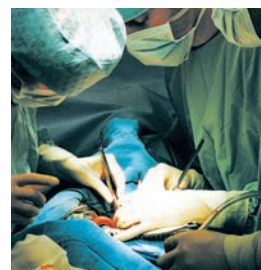
CHU de Rennes (teaching hospital), an international leading centre for liver transplants.