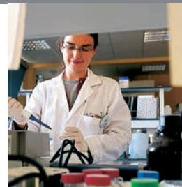
56 research units, a total of 2,000 people, are involved in the genomics cluster "Ouest-génopole".